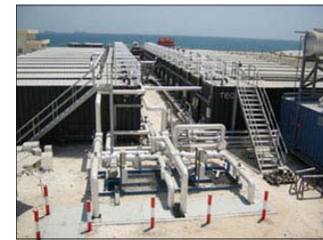
Create Site Storage Tankage